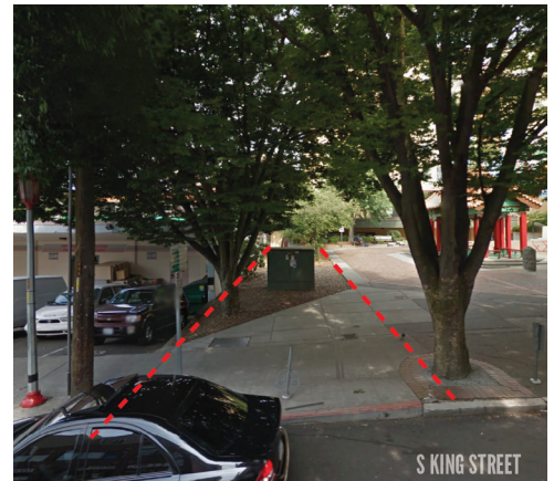
Looking north from S King St along the alley right-of-way at the existing utility box